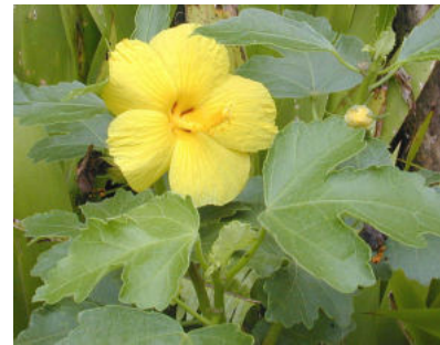
Yellow Hawaiian Hibiscus or Pua Moa Hau Hele

A simple tribute to all the people in Hawaii who have been affected by the fires.