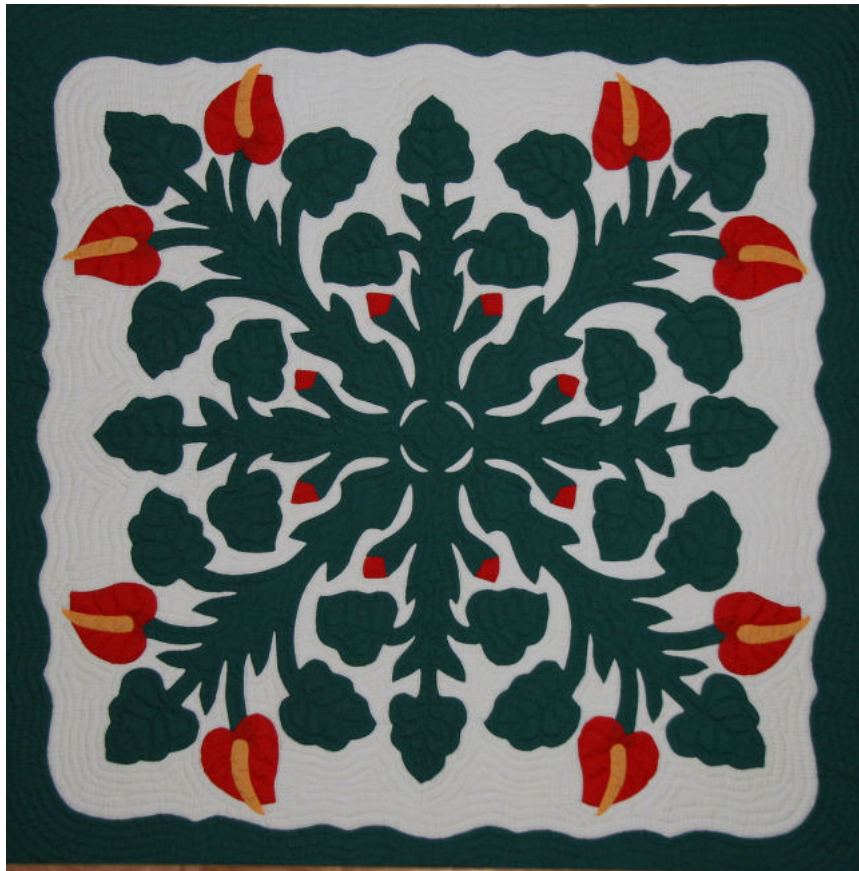
A Hawaiian quilt

Hawaiian quilt applique is made from a single cut on folded fabric. Quilting stitches normally follow the contours of the applique design.